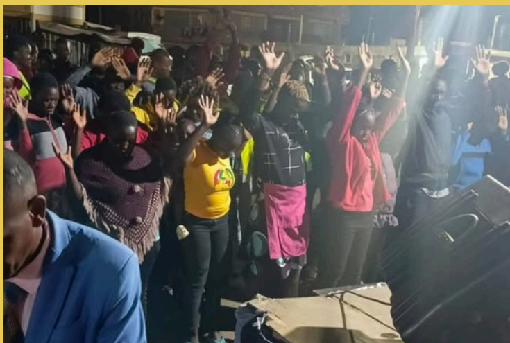
People receiving Christ at an outreach organized by one of our students